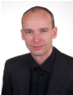
Professor, Institute of Computer Science, University of Innsbruck, Austria