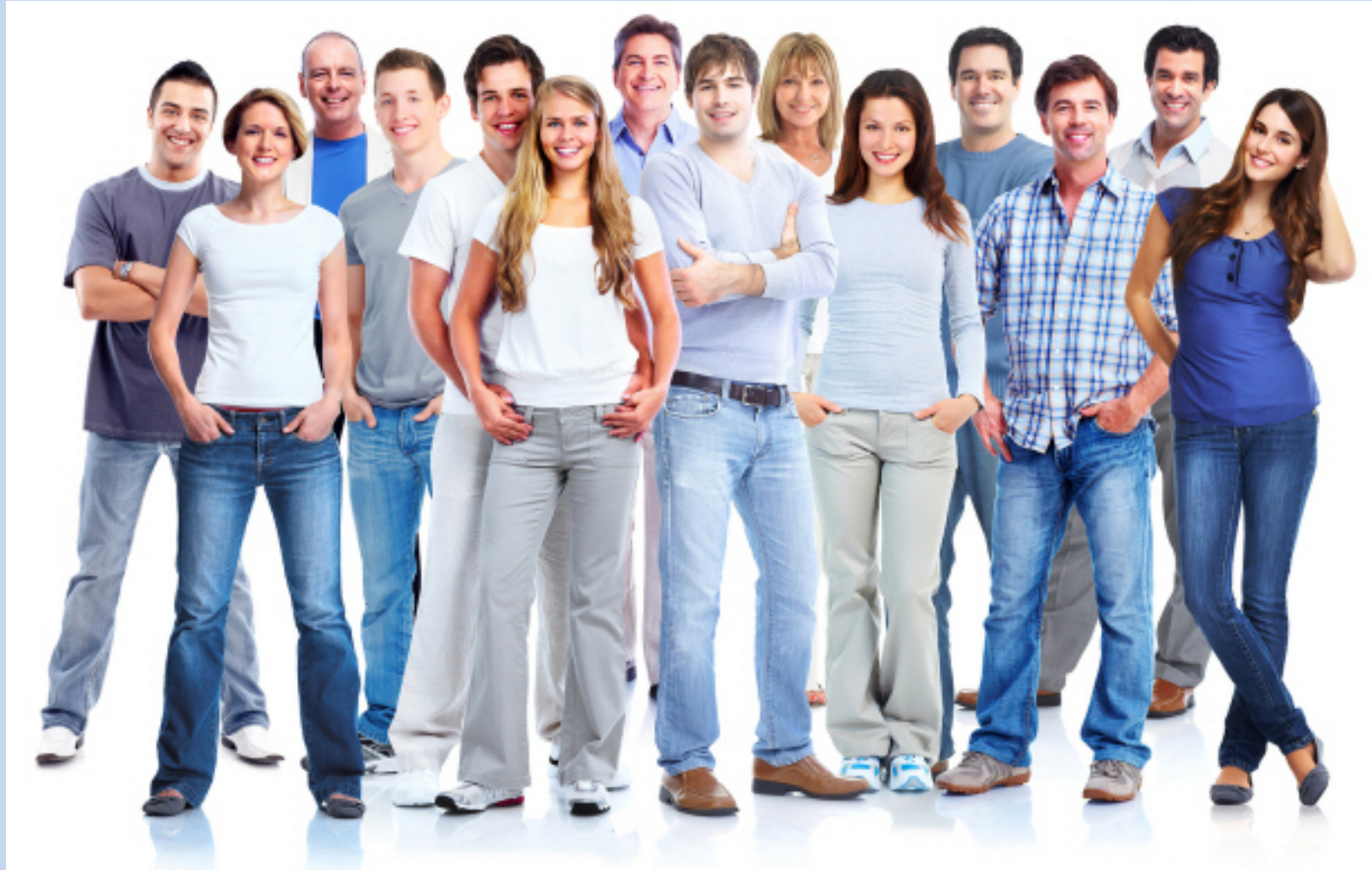
IEEE Buenaventura Section