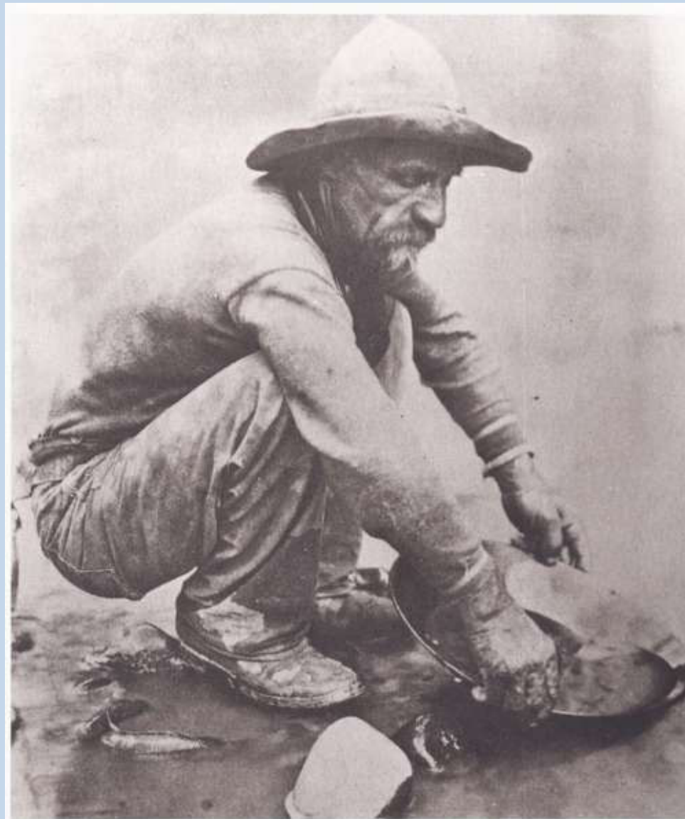
IEEE Buenaventura Section