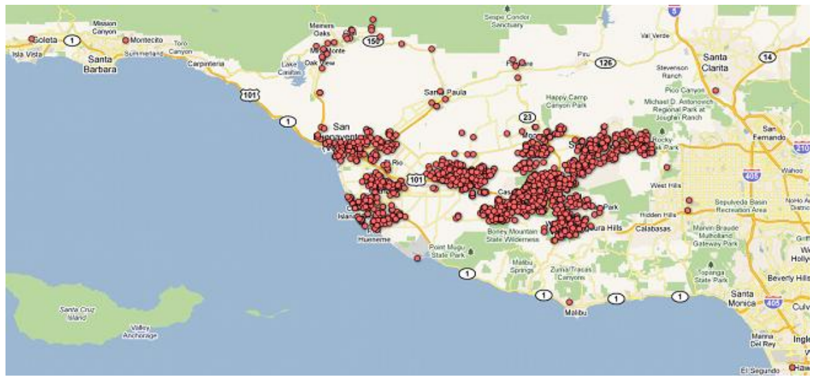
BV Section Membership by Primary Address 1

Where is everyone? Thanks to Google's <u>Fusion Tables</u>, geo-mapping is now a 5-minute task. According to the Section membership database, most IEEE members live along the 101 tech corridor and the Simi-Newbury Park axis: